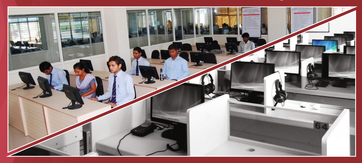
Computer Lab & English Language Lab