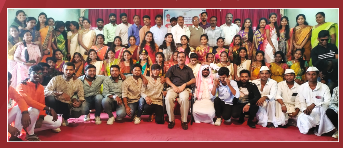
S.A. Cult-Fest - 2022