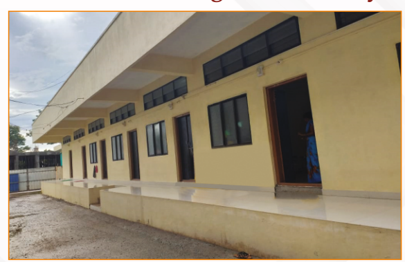
Hemaraddi Mallamma Ladies Hostel