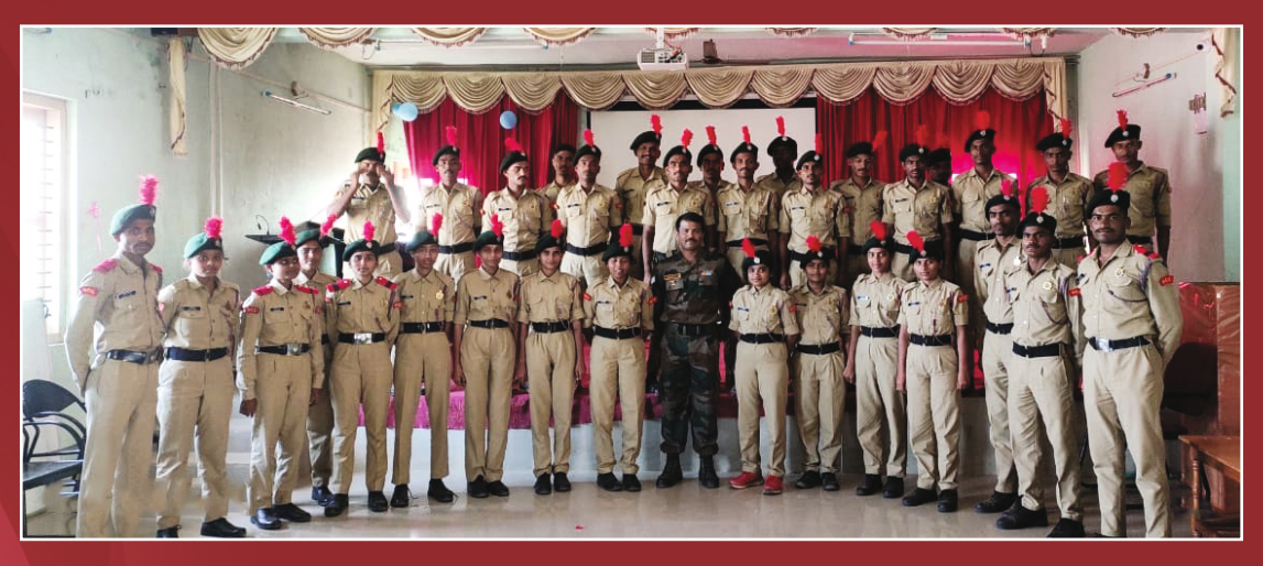
NCC CADETS, 3A/38 Kar Bn NCC Gadag