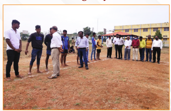
Inter-class Cricket Tournament