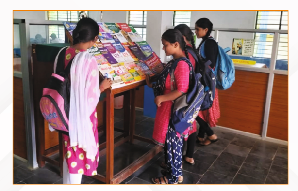
Students Reading in the Library