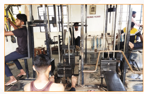
12 Stage Gym