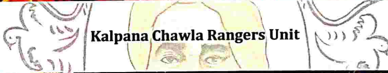
Kalpana Chawla Rangers Unit