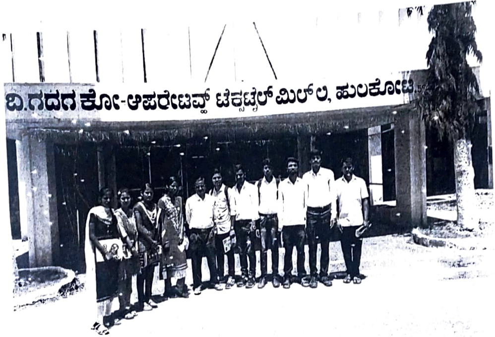
FIELD WORK STUDENTS STANDING IN FRONT OF COTTON TEXTILE INDUSTRY AT HULKOTI