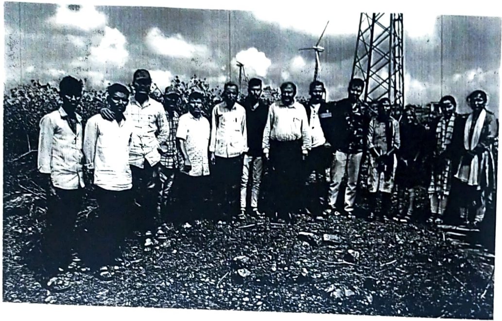
FIELD WORK STUDENTS ALONG WITH PROFESSOR IN FRONT OF ELECT CONVERTOR RIS TOR