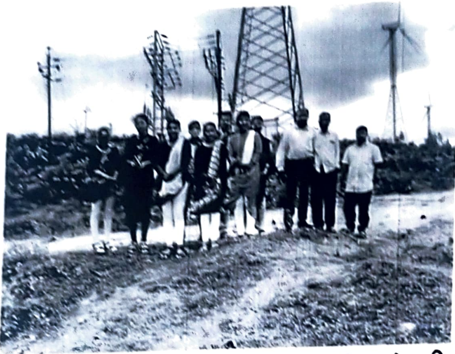
GENERATION OF WIND POWER AT KALAKALESHWARA HILL GAJENDRAGADA