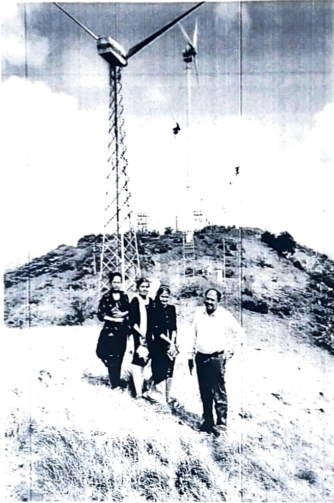
VIEW OF ELECTRIC CONVERTER AT KAPPATA GUDDA.