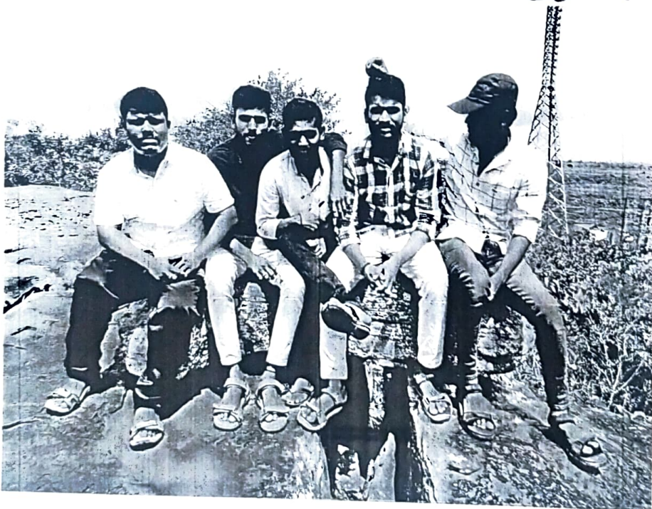
FIELD WORK STUDENTS