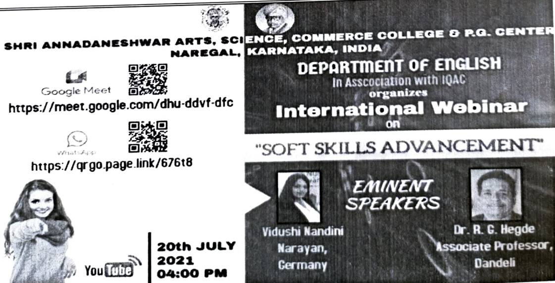
Brochure of International webinar on "Soft Skills Development"